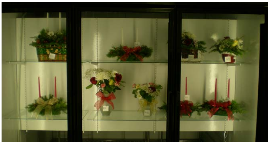
Some centerpieces that were showcased for sale at last year's Holiday Shop