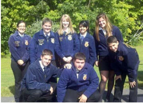
2011-2012 Officer Team (Not all pictured)

This is your president saying, HAVE FUN!